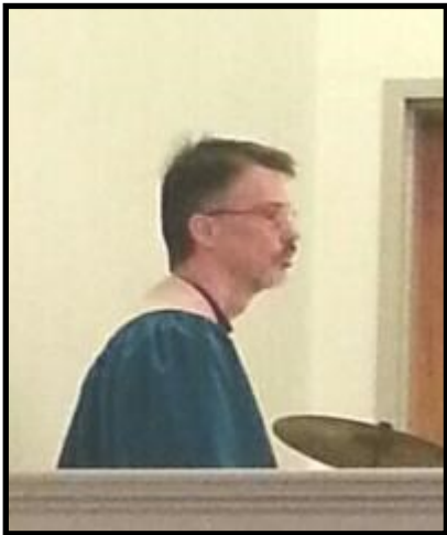
Mark Clark Worship